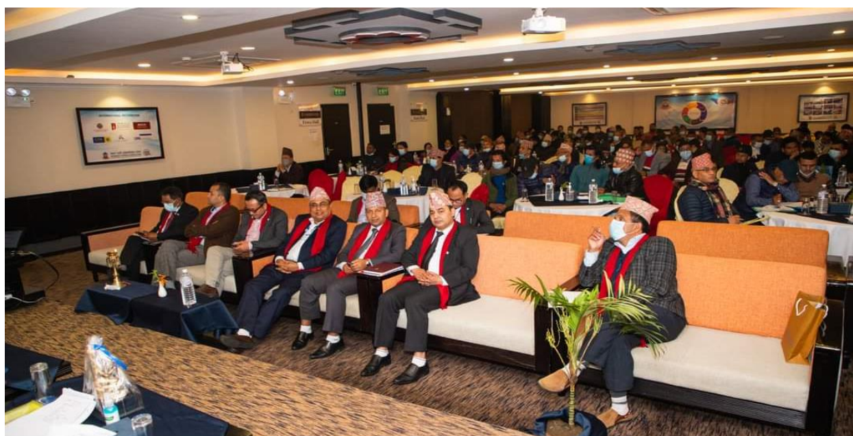
A Glimpse of Workshop on Dimension of Public Financial Management at Province and Local Level