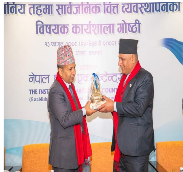
A Glimpse of Workshop on Dimension of Public Financial Management at Province and Local Level